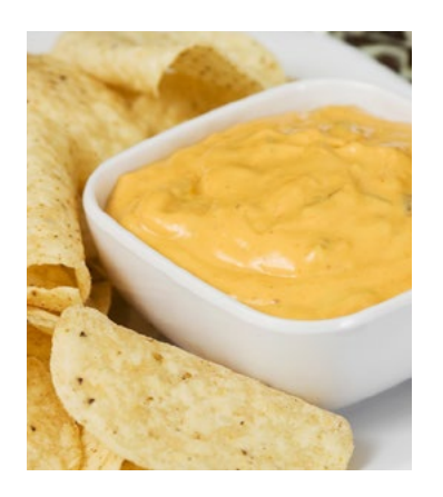
Alberger® Potassium Pro®

Featuring Alberger® fine prepared flour salt and Potassium Pro® ultra fine potassium salt